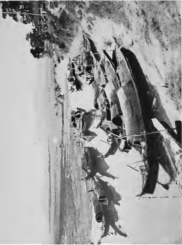
View of Bhamo, Upper Burma